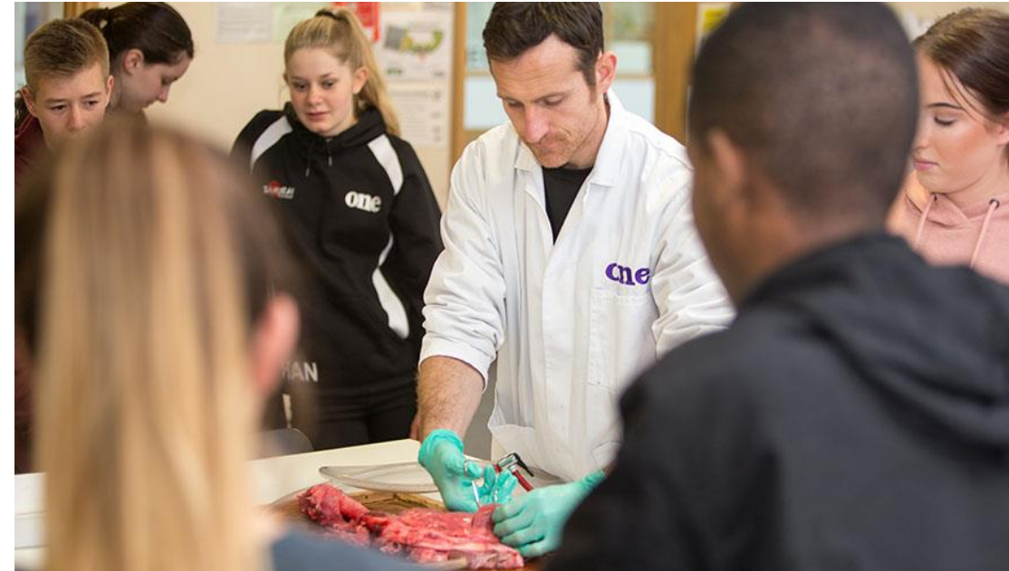
Sports BTEC at Suffolk One is popular among students that enjoyed the practical elements of GCSE PE over the exam.